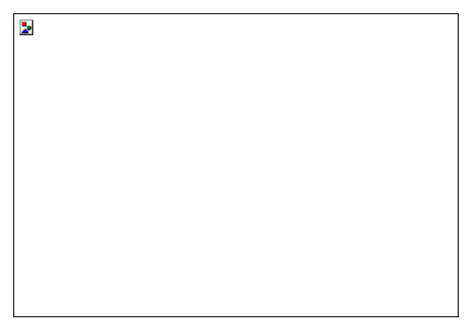
Figure 3: Rank (Log) - Frequency (log) Plots of Original and Cleaned Terms.